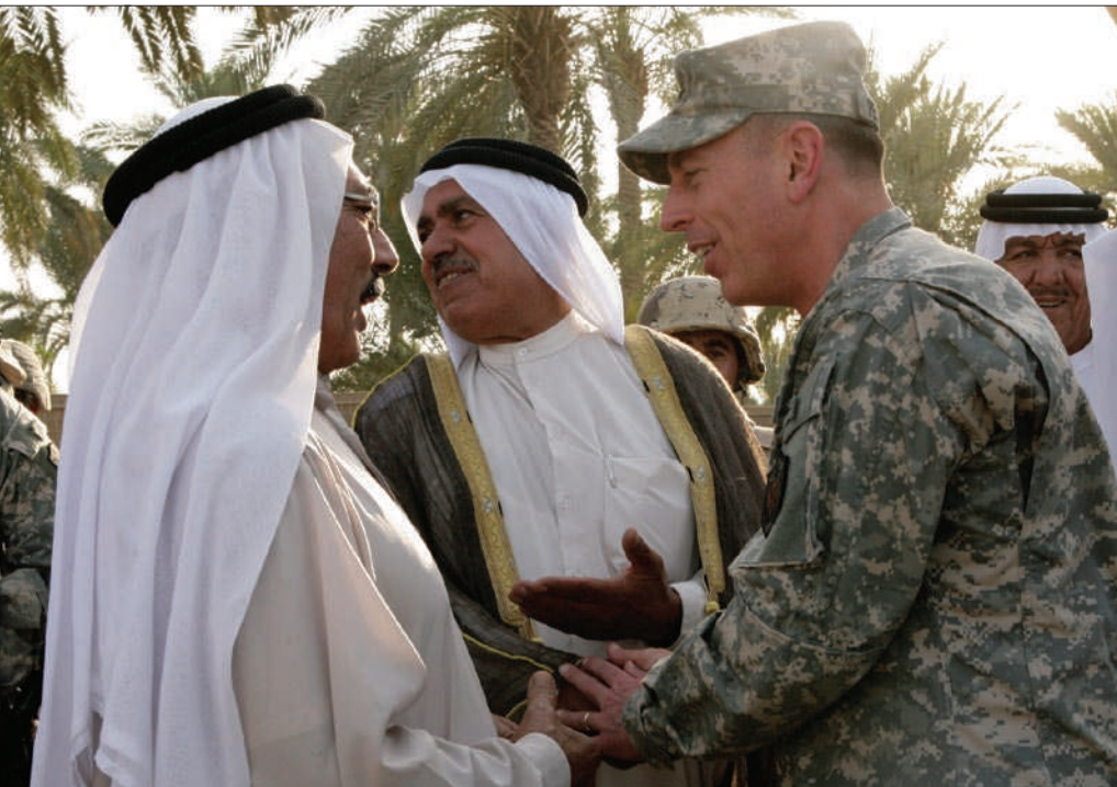
General David Petraeus's alliances with local leaders in Iraq resulted in fewer American casualties.